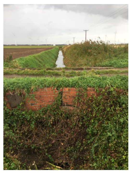
Cross Drain looking toward Shipcote Drain