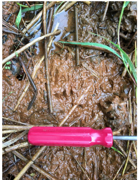
Star shaped water vole footprints