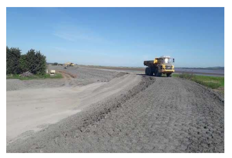
Bank West of River Ancholme taking shape

The embankment to South Ferriby village frontage was completed in Nov 2019. Finishing works are taking place now including trimming, top-soiling/grass seeding and Fulsea Drain head wall construction. CEMEX will shortly have provided all of the 140,000 tonnes of material for construction of the western embankments in phase 2.