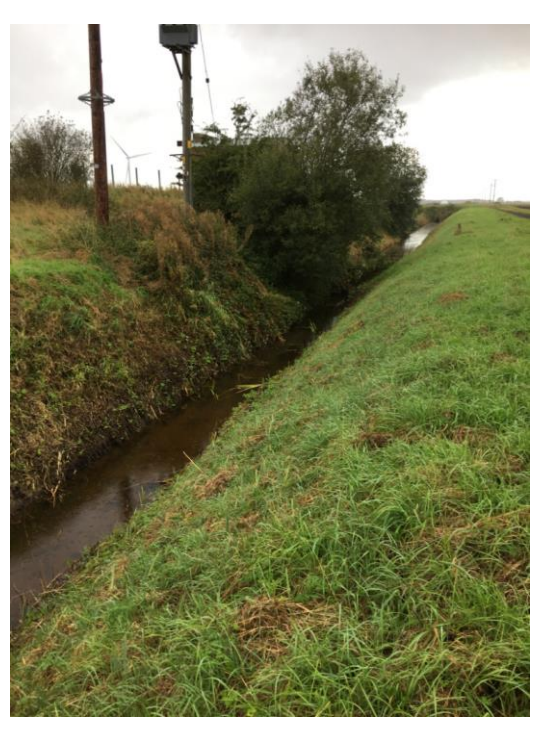
Cross Drain toward pump station