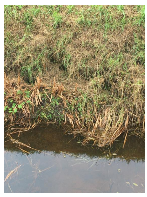
Burrows in bank at different levels