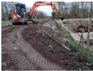
← At the start of that week (23 Nov), the topsoil strip was completed.