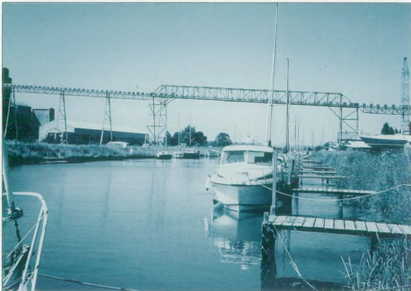
Moorings at South Ferriby

Footpaths are also an important recreational facility within the catchment. The Humber Estuary CMP Action Plan proposed to produce a Management Plan for Agency owned banks, to improve and provide recreation facilities and access where appropriate.