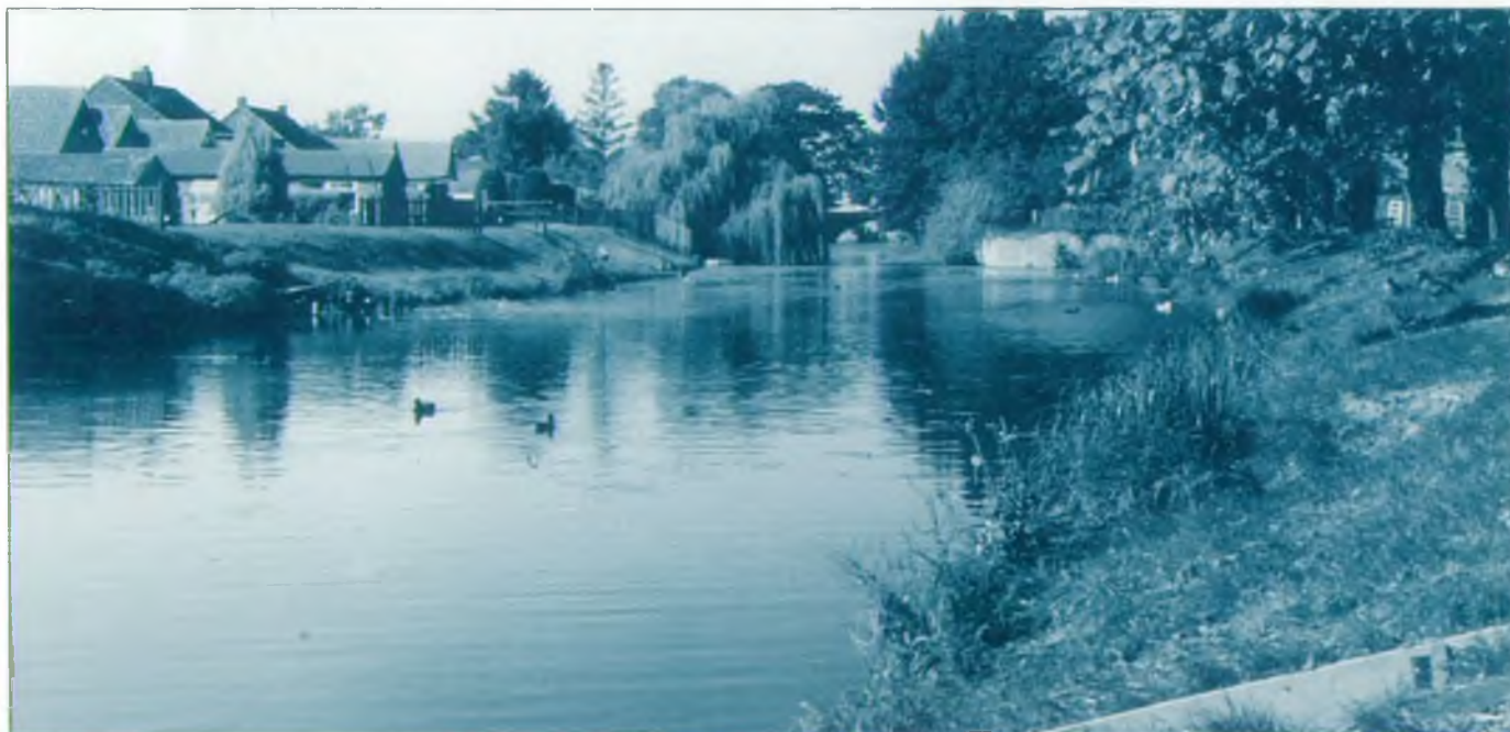
Old River Ancholme - Brigg

This Action Plan outlines areas of work and investment proposed by the Agency and other responsible parties over the next 5 years, and will form the basis for improvements to the environment in the Catchment. Progress against the Action Plan will be monitored and reported annually.