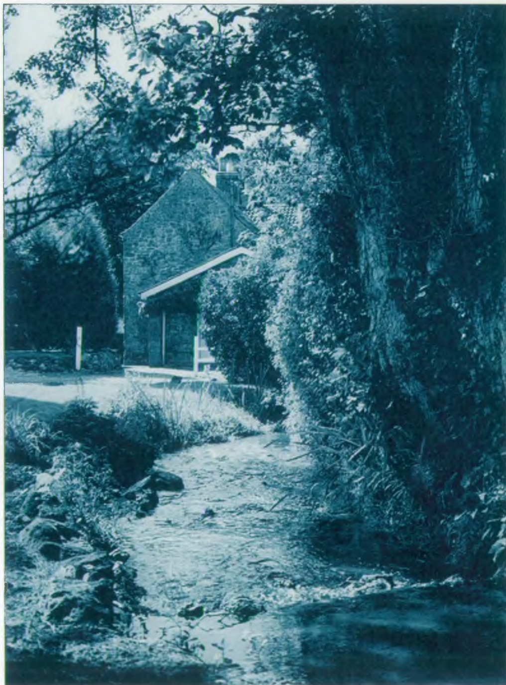
River Rase at Tealby

The majority of the more swiftly flowing becks and streams in the Catchment are to be found in the south eastern corner feeding the River Rase. These contain lengths with riffle and pool sequences, which are valuable for the biological and habitat diversity they provide. Some areas have been adversely affected by impoundments and land drainage works. Any future proposals to abstract water from these streams will require careful consideration, to assess their impact on the water environment.