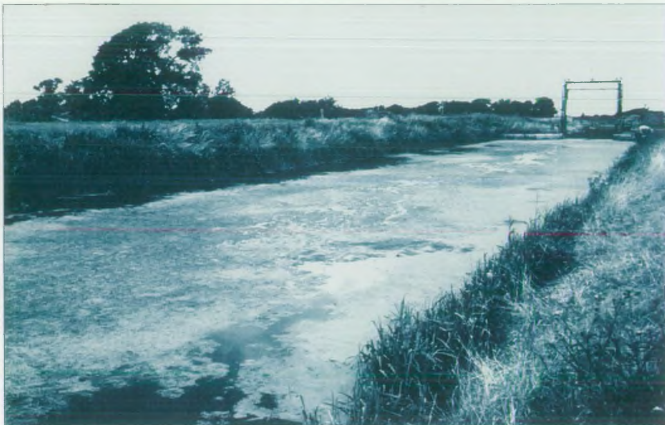
Harlam Hull Lock - currently being restored