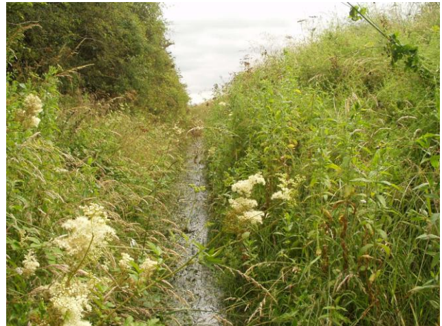
Candley Beck Drain

Where possible, without creating additional undue risks of flooding, leaving a fringe of uncut vegetation at the waters edge in watercourses of an appropriate size helps stabilise the toe of the banks and provides over wintering shelter for insects and small mammals.