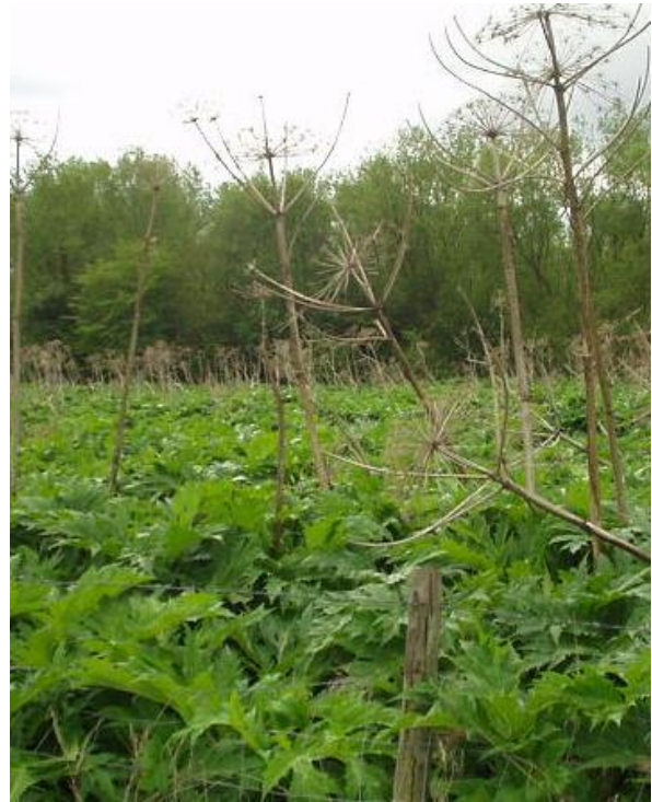
Giant Hogweed Heracleum mantegazzianum

Any Invasive Non Native Species identified on or in Board maintained watercourses will be reported to the GB Non Native Species Secretariat.