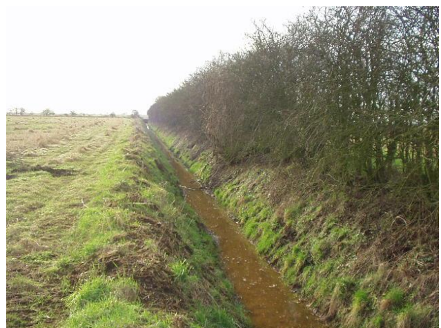
North Kelsey Cross Drain

This ensures clear passage for flow within the watercourse, provision for increased capacity during wetter winter months, stimulates bank side vegetation that maximises bank side protection and provides suitable food source for species such as water vole and allows inspection of Board asset structures.