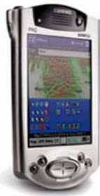
Left : JBA's GISmo

Condition Assessment The condition surveys were undertaken by a walker over survey, following the guidelines within the Environment Agency's Condition Assessment Manual. Each asset identified was surveyed and photographed and a condition grade assigned. To increase the speed and accuracy of the field survey, JBA Consulting's hand held computer software GISmo was utilised. This allowed assets locations to be fixed in the field using the Global Satellite Positioning system. The use of GISmo significantly reduced both field and data processing time, enabling the entire survey to be completed within 6 months.